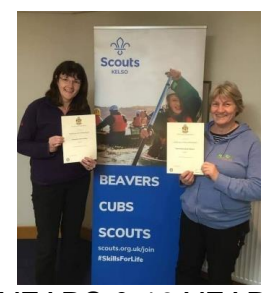
5 YEARS & 10 YEARS