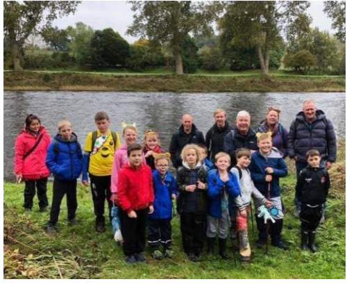
HELPING KEEP THE STREETS CLEAN