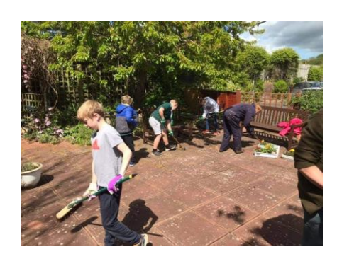
ANNUAL HOSPITAL GARDEN CLEAN UP