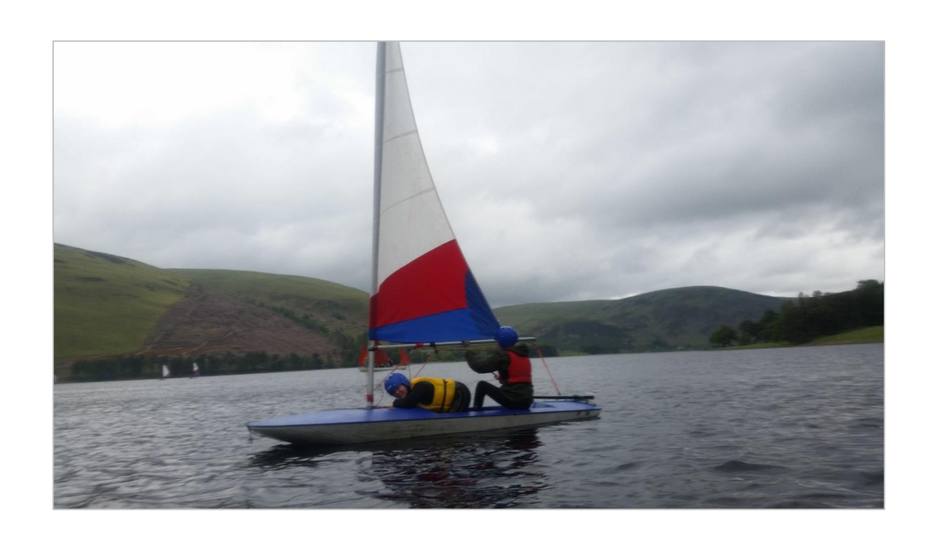
Fun on the Water St Mary's Loch